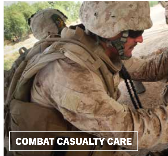
COMBAT CASUALTY CARE

external defibrillator (AED) into a user-friendly first responder kit to provide the same quality of care as an EMT or a paramedic. During a tense rescue, both experienced and first-time rescuers can save a life.