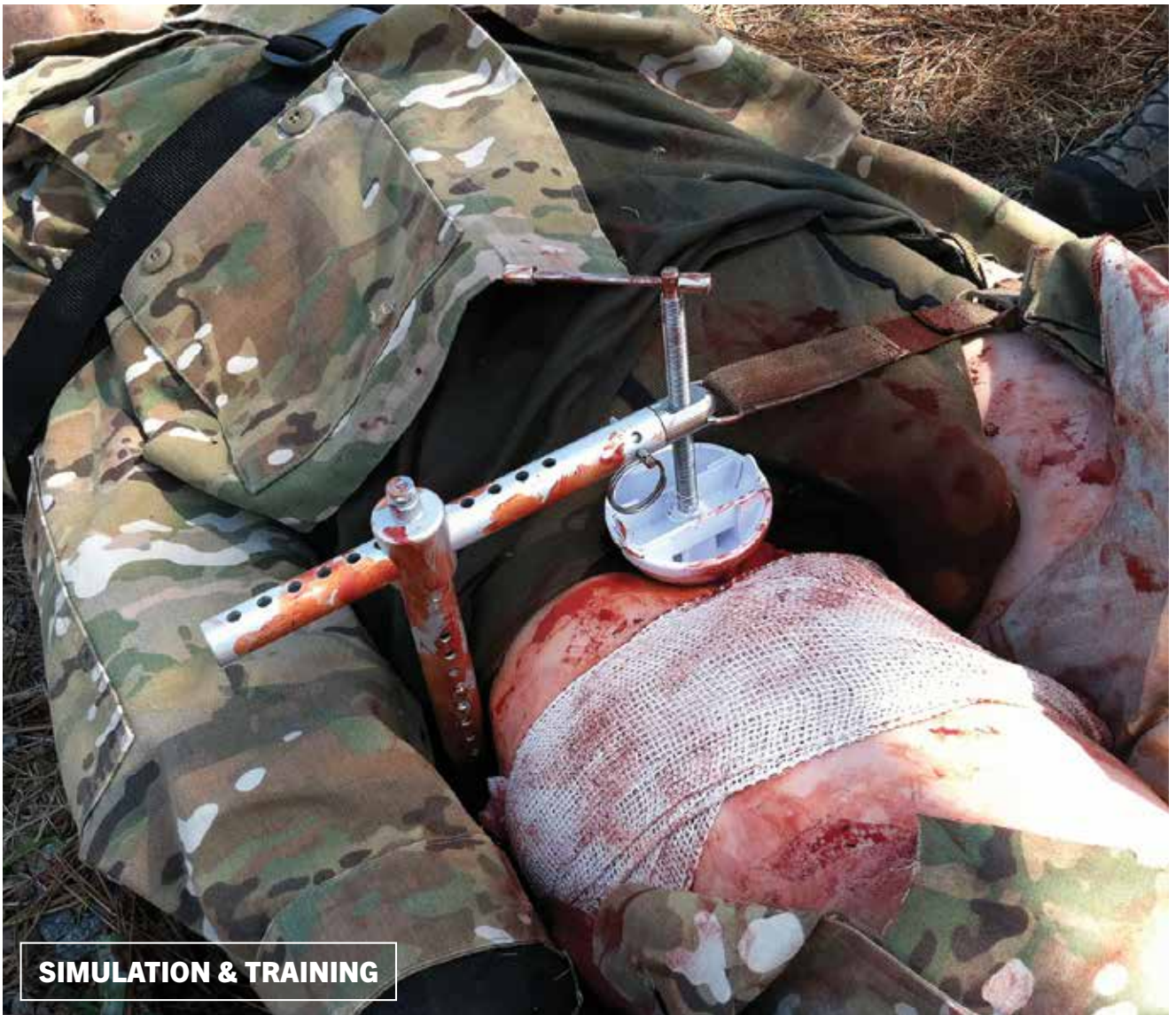
SIMULATION & TRAINING